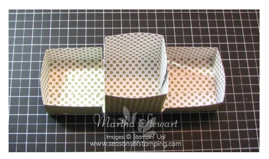
Now you are ready to decorate!